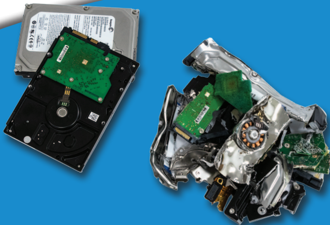
3.5" HDD Hard Drives Shredded with the FD 87HDS-R