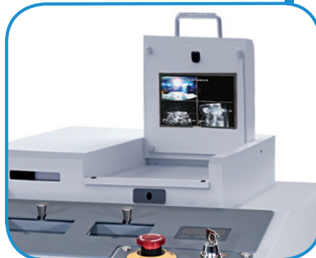
Recording System internal and external cameras to monitor input and output of drives for optimal security